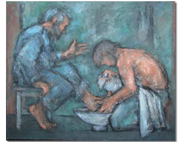
The washing of the feet Ghislaine Howard (b.1953) Acrylic

We are also considering establishing open commissions in one or more of the creative arts to encourage responses to the pieces through for example painting, poetry or prose.