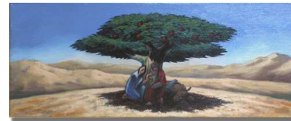
Rest on the flight into Egypt Nicholas Mynheer (b.1958 ) Oil

Pieces range from life size figures down to small, almost postcard size pieces, and employ a variety of media – oils, watercolour, gouache and collage. Some are highly figurative, others much more abstract in character, but all challenge the viewer to reflection and meditation.